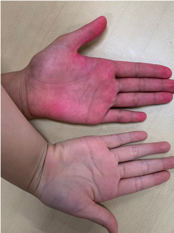
TOP: Dyed hand BOTTOM: Normal hand